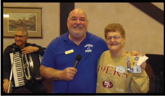
Bob & Rose CD winner