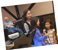
A selection of shots from last year!