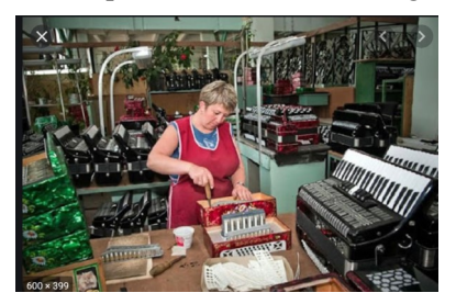
A Russian worker in an accordion factory. You can almost see batches of accordions around her.

The essence of modern production is to reduce every step to a standard procedure that is readily followed by a workers, usually in combination with machinery. That hasn't been completely achieved (yet!) for accordions: some hand craft is still required around the cutting, installing and tuning of reeds. But the Soprani factory took enormous steps towards these